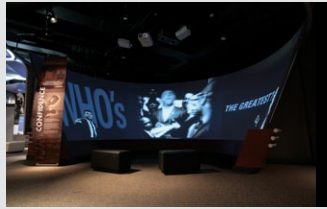
Muhammad Ali Center