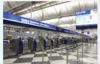
United Airlines at Chicago O'Hare Airport

For even the most exceptional circumstances, the service team is prepared. As a member of the Electrosonic family, we have immediate access to a large number of highly skilled audio-visual engineers. Our strong relationships with AV product manufacturers further ensures your peace of mind.