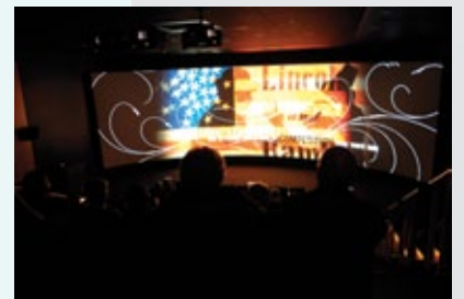
Gettysburg National Military Park Museum