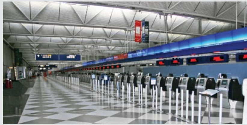
United Airlines at Chicago O'Hare Airport