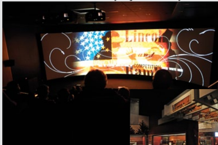
Gettysburg National Military Park Museum