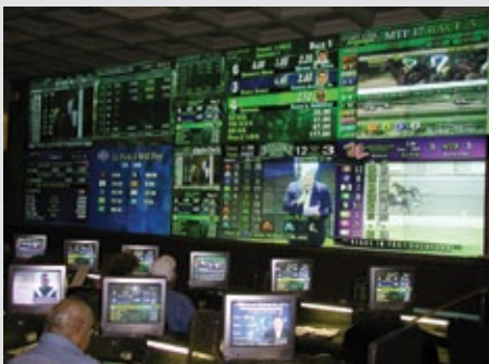
Delaware Park Racetrack

"Delaware Park Racetrack enlisted Electrosonic's Lamp Program and the overall experience has been a great one. Our Electrosonic service technician has a great eye for detail and color, which comes in handy when he balances the lamps for our vision cubes."