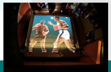
Muhammad Ali Center