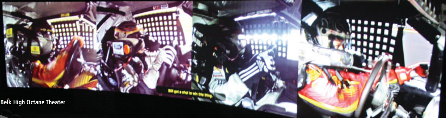
Belk High Octane Theater

The interactive exhibits allow visitors to partake in NASCAR activities, such as changing tires, and provide fun games for guests to learn more about NASCAR. The Media Broadcast Area allows guests to broadcast races live through touch screens, headsets, monitors and consoles. In Period Milestones, guests experience a bit of NASCAR history by answering trivia questions through touchscreen interactive stations. To eliminate excessive noise overlaps between the interactive exhibits, Electrosonic installed directional audio systems with narrowly focused speakers that keep noise bleed to a minimum.