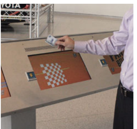
The hard card with RFID technology