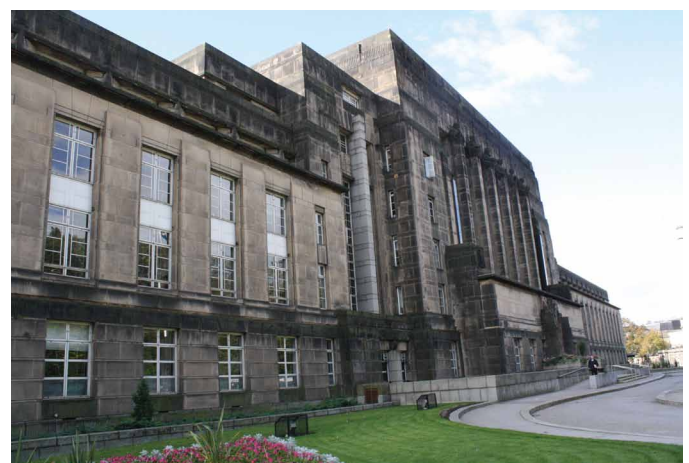
St Andrew's House