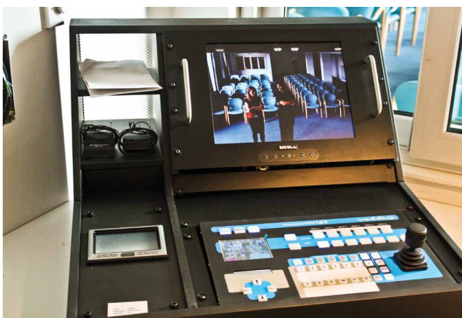
The video camera controller